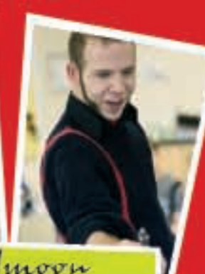
The Redmoon Company, Chicago, USA

@ The Regional Cultural Centre, Letterkenny